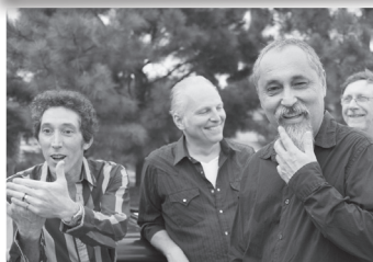
THE IGUANAS Sat, Jun 20, 7:15pm

MESCHIYA LAKE & THE LITTLE BIG HORNS Sun, June 21, 1:30pm & 3:30pm