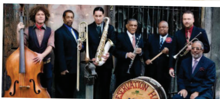
PRESERVATION HALL JAZZ BAND Sun, June 21, 4:30pm

HURRAY FOR THE RIFF RAFF Fri, June 19, 8:30pm