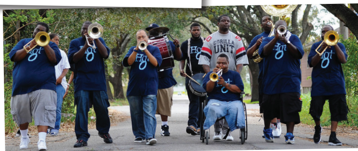
HOT 8 BRASS BAND Sat, June 20, 6:00pm & Sun, June 21, 12:30pm