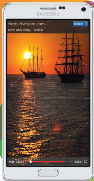
Samsung GALAXY Note 4