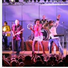
The Tidewater Drive Band