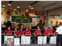
The Khedive Notables Dance Band www.khediveshrine.org