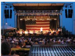
Virginia Symphony Orchestra