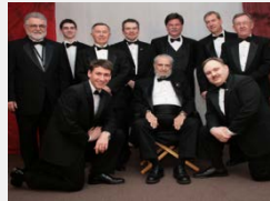
The Top Hats Orchestra www.tophatmusic.com