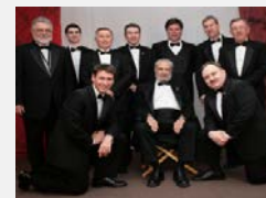
The Top Hats Orchestra