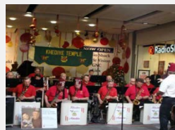
The Khedive Notables Dance Band