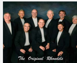
The Original Rhondels