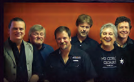
ATLANTA RHYTHM SECTION