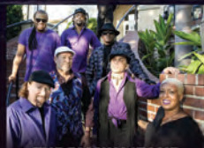
THE FAMILY STONE

TOWN POINT PARK DOWNTOWN NORFOLK WATERFRONT, VIRGINIA MILE MARKER ZERO ON THE INTRACOASTAL WATERWAY FREE & OPEN TO THE PUBLIC