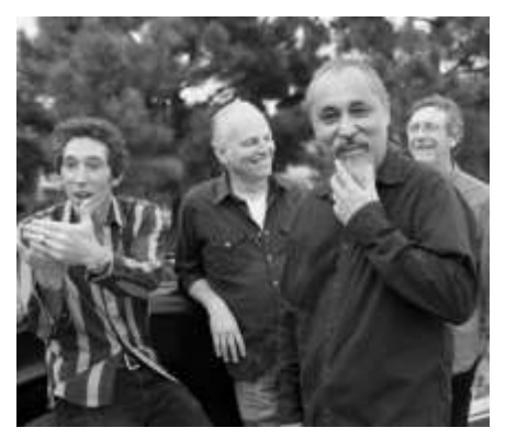
Saturday, June 20 at 7:15pm The Iguanas www.iguanas.com

their unique brand of music to celebrate, to heal and to learn. This passion for music and social outreach led to an integral role contributing to the success of the Finding Our Folk Tour.