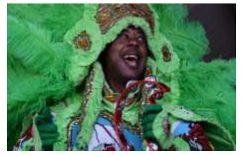
Saturday, June 20 at 3:45pm CHA-WA - <u>www.chawaband.com</u>

The infectious music and dazzling stage show of Cha Wa has been described as "funk with feathers" – a sound rooted in traditional New Orleans Mardi Gras Indian music mixed with funk and soul, creating a non-stop groove machine. If you're lucky enough to find yourself on the corner of Second and Dryades on Mardi Gras Day, you will hear "Cha Wa" chanted in celebration throughout the streets. Cha Wa brings the New Orleans Second Line parade to the stage. Make sure to put on your dancing shoes!