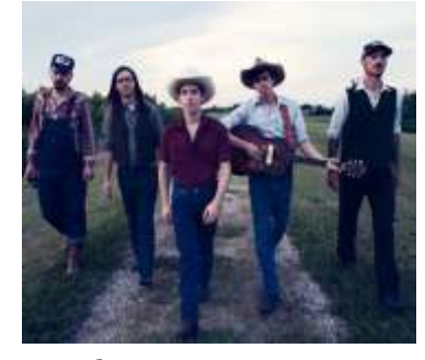
Saturday, June 20 at 2:15pm The Deslondes – www.thedeslondes.com

The Deslandes are a New Orleans-based country-soul, swamp-boogie band. In their writing and performing, they combine elements of early Stax, Sun and Atlantic records with the influence of a more raw, stripped-down sound gleaned off field recordings from Alan Lomax and Mississippi Records catalogue.